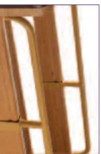
Side rail extensions