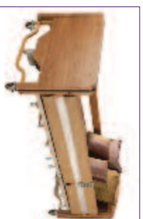
Side rail pads